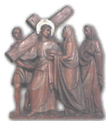
with Saint Alphonsus Liguori