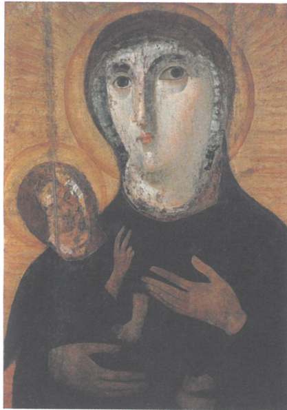
Virgin Hodegetria, Rome, c. 500–525, the oldest known example of an Icon of The Way, in the Benedictine monastery attached to the Church of St Francesca in the Roman Forum

We entrust the results of this Synod to the Virgin Mary, who bears the splendid title of Hodegetria , (which translates from the Greek to "She who shows and guides the way"). May Mary, Mother of the Church, who in the Upper Room helped the newly formed community of disciples to open themselves to the novelty of Pentecost, teach us to be a people of disciples and missionaries walking together, to be a synodal Church.