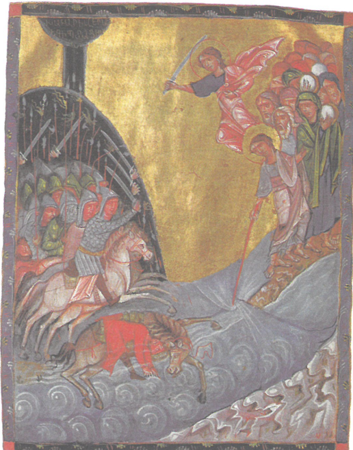
The Passage of the Red Sea Manuscript by Toros Roslin, 1266

cautions us not to hanker for the imagined securities of the past that can only divide and rob us of a future. The crossing of the Red Sea marks a clear break with the past. There is no going back. Likewise, the waters of baptism are a liberation from our multiple slaveries, yet at the same time our passport to a new future as "pilgrims of hope" (to use the Holy Year theme). However, it is not a "future" idly waiting for us to just pitch up. It is a future which we have to work at, not least by cleaning up the environmental pollution that our polluted souls have caused. Blessing the Easter water we pray: "Cleanse us from sin in a new birth of innocence."