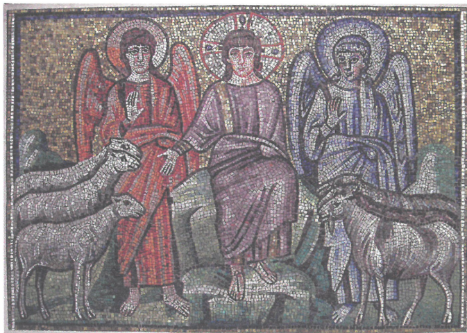
Separation of the Sheep and the Goats, Byzantine Mosaic, early 20th C (original dated early 6th C)

The Feast of Christ the King brings our final Link reflection for the Year of Prayer. However, we will not consider prayer per se but the fruits of prayer. The Lord said to St Teresa of Ávila: "This is the purpose of prayer, my daughter: the birth of good works." One can easily link this to the words of Jesus in Matthew 7:21 – "Not everyone who keeps saying to me, 'Lord, Lord,' will get into the kingdom of heaven, but only the person who does the will of my Father in heaven." Prayer is empty, indeed it is hypocritical, if it does not bear fruit in the transformation of our lives into a surrender to God's will of love. What can we learn about this from the Feast of Christ the King?