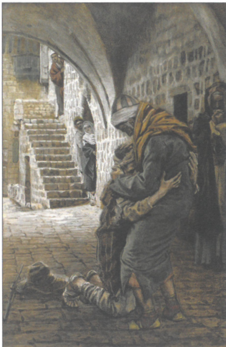
The Return of the Prodigal Son by James Tissot, in the Brooklyn Museum

at first calls it a "stepping over", but as his thoughts progress, he says forgiveness is more like "climbing over". Rising above my hurt and feelings of anger, "we have to climb over the walls of angry feelings, of fear of being used or hurt again... of pride, and the desire to stay in control." But, says Nouwen, every time we do that, we rise above our ego in the forgiving power of the death and resurrection of Christ. We learn, in Christ, to become as merciful and compassionate as our Heavenly Father is merciful and compassionate. How true the saying, to err is human, to forgive is divine!