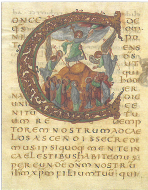
The Ascension, from the Drogo Sacramentary, c.850 AD

We live in an expanding universe, not just physically but spiritually and mystically. May we never lose sight of the "cloud", the abiding presence of God in the resurrection and ascension of His Son.