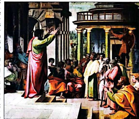
St Paul in Athens delivering the Areopagus sermon in which he addressed early issues in Christology, depicted in a 1515 portrait by Raphael

The great Pauline scholar, N.T. Wright, wrote: "Paul upstages the claims and systems of paganism in the name, and for the glory, of the one God of Israel, the God now revealed through Jesus and the Spirit".