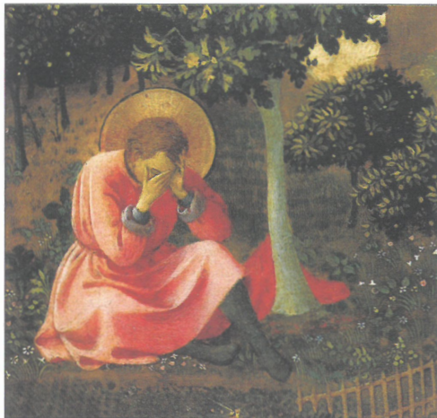
Detail of a painting of St Augustine's Conversion by Fra Angelico

Late have I loved you, O Beauty so ancient and so new: late have I loved you! For behold you were within me and I outside, and I sought outside, and in my ugliness fell upon those lovely things that you have made... You called and cried to me and broke open my deafness... you breathed fragrance upon me, and I drew in my breath and do now pant for you. I tasted you and now hunger and thirst for you: you touched me and I have burned for your peace.